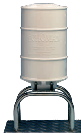
(Brackets not included)