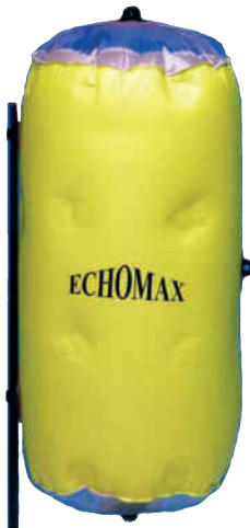
(Brackets not included)